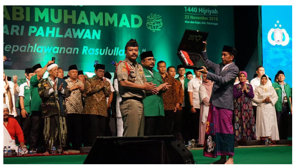
Indonesian President Joko Widodo displays the Nusantara Statement at a November 2018 gathering of 100,000 members of Gerakan Pemuda Ansor in Pekalongan, Central Java

profound polarization that threatens the integrity of those societies' democratic systems. On both the political left and right, attitudes towards Islam have become a proxy battleground in a wider struggle for power that politicizes Islam and renders Muslims highly vulnerable to any breakdown in political order.