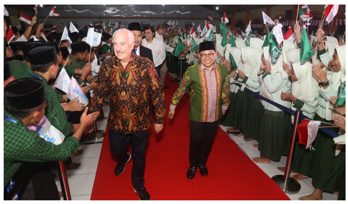
PKB Chairman H. Muhaimin Iskandar, Andrés Pastrana Arango and other CDI Executive Committee members welcomed by students of Pondok Pesantren Pandanaran Islamic boarding school in Yogyakarta, Indonesia, on January 24, 2020

duly constituted authority of the nation state. As the 2019 National Conference of Nahdlatul Ulama Religious Scholars decreed, in a ruling that also abolished the legal category of infidel (kafir) within the modern nation state: "If it is concluded that any element of positive (i.e., statutory and/or regulatory) law contravenes the highest principles and purposes of religion, this should be—and may only be—corrected by constitutional means. The existence of such laws and regulations may not be employed as a justification for defying a legitimate government."