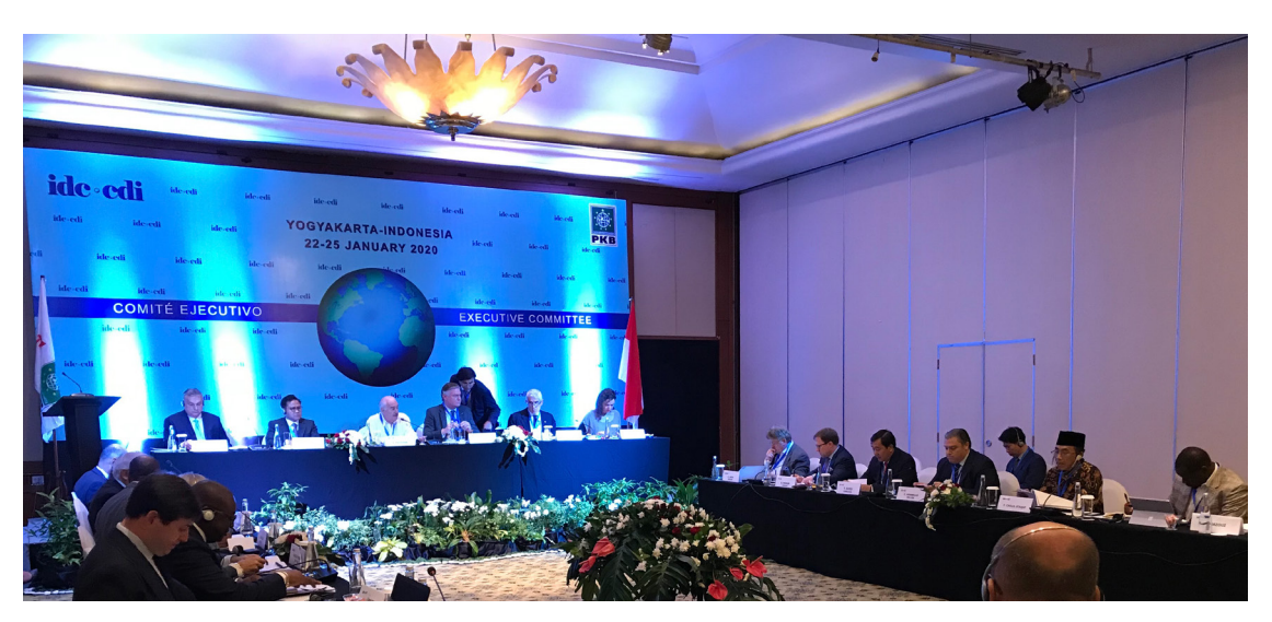
On January 23, 2020, the Executive Committee of CDI unanimously adopted PKB's <u>Resolution on promoting a rules-based international order founded upon universal ethics and humanitarian values</u> (above).

enmity and violence, once it spirals out of control, other than the collapse of the prevailing socio-economic-political system wherever such chaos occurs. As Gus Dur warned in a 2005 article published in the Wall Street Journal :