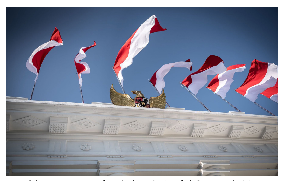
Indonesia is emerging as a major force within the geopolitical arena for the first time since the 1950s, as the Humanitarian Islam movement forges religious, socio-cultural and political alliances globally

In recent decades, Western human rights discourse has increasingly deviated from the clear, concise and rigorously defined principles articulated in the thirty articles of the Universal Declaration of Human Rights (UDHR), which were adopted by the United Nations General Assembly on December 10<sup>th</sup>, 1948, as a concrete means to promote "universal respect for, and observance of, human rights and fundamental freedoms for all without distinction as to race, sex, language, or religion" ( United Nations Charter , Article 55). Having emerged in the aftermath of WWII and all its horrors, UDHR