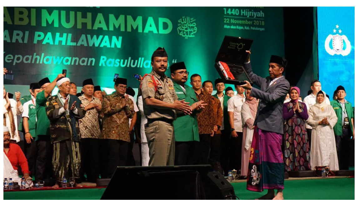
Indonesian President Joko Widodo displays the Nusantara Statement at a November 2018 gathering of 100,000 members of Gerakan Pemuda Ansor in Pekalongan, Central Java

profound polarization that threatens the integrity of those societies' democratic systems. On both the political left and right, attitudes towards Islam have become a proxy battleground in a wider struggle for power that politicizes Islam and renders Muslims highly vulnerable to any breakdown in political order.